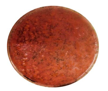
Figure 2. Culture and initial bacterial growth.

After microbial culture, 63 samples turned out to be possible positive, for which microscopic observation analysis was carried out in order to confirm that they are Gram -, resulting in all 63 samples being Gram negative.Where, greater positivity by culture was evidenced in the Echeandía sector with 31 of 47 samples, followed by Salinas 19 of 32, San Lorenzo 11 of 17 and finally, San Pablo 2 of 4.